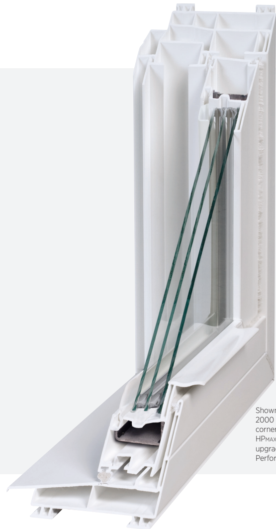
Shown in Contractor 2000 Series Double Hung corner cut featuring HP MAX glass package upgrade with High DP Performance option