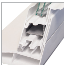
High DP Performance option features reinforced rails and stiles

Images show metal reinforcement in a double hung configuration. Also available for a sliding window.